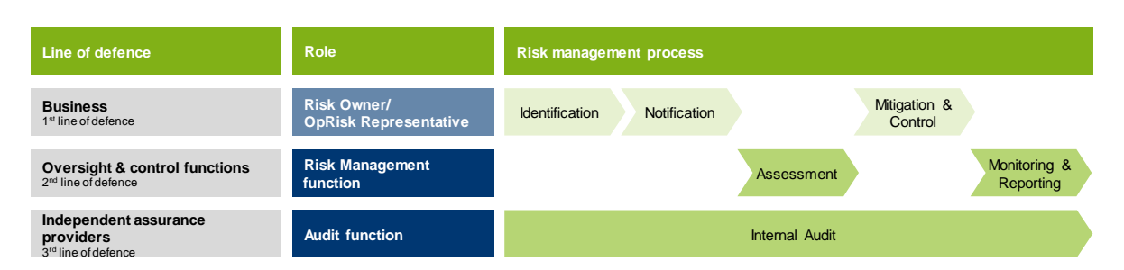
Figure 3. Five-level risk management system with central and decentralised responsibilities

Controlling risks is performed in the decentralised business areas, that is, where the risks occur. Risk control in the ECAG operational units is ensured by nominating "Operational Risk Representatives" who are responsible for identifying, notifying, and controlling any risk in their area. Eurex Clearing Enterprise Risk Management ("ERM"), a central risk controlling function within ECAG, assesses all existing and potential new risks and reports on a quarterly basis, and if necessary ad hoc, to the Executive Board.