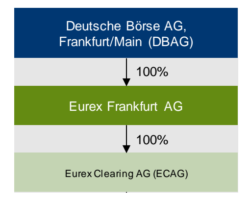
Figure 2. Overview corporate structure

Eurex Clearing AG is a wholly owned subsidiary of Eurex Frankfurt AG that in turn is wholly owned by Deutsche Börse AG ("DBAG"). A control and profit transfer agreement dated 18 November 1998 is in place between Eurex Frankfurt AG and Eurex Clearing AG. Eurex Clearing AG does not have any branches as of 31 December 2022.