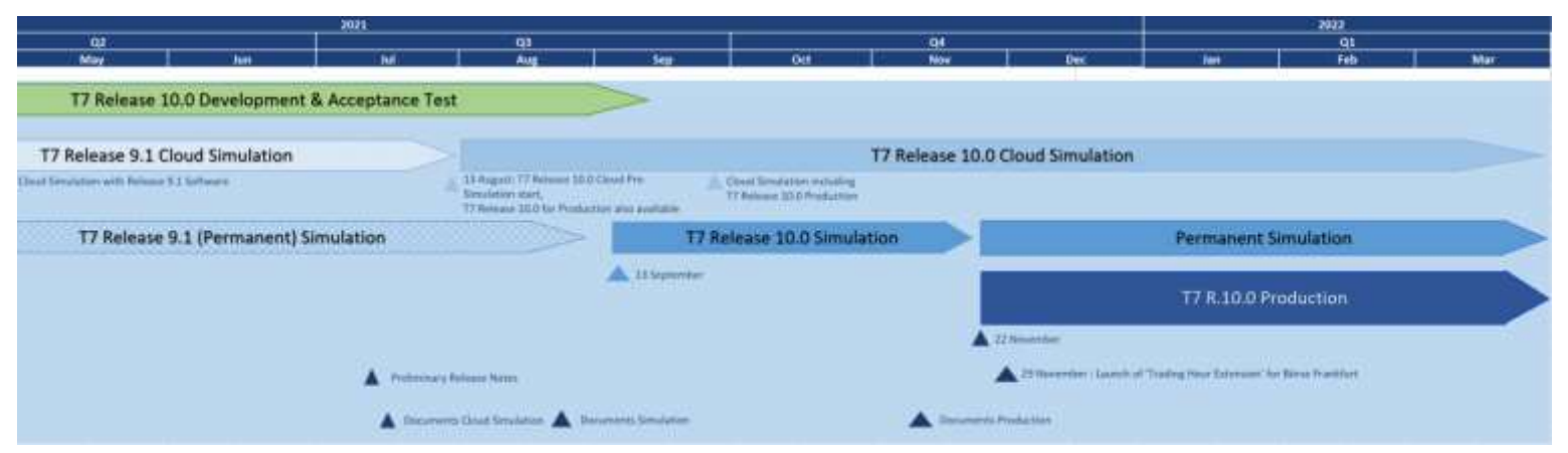
Figure 1: T7 Release 10.0 document publication and introduction timeline