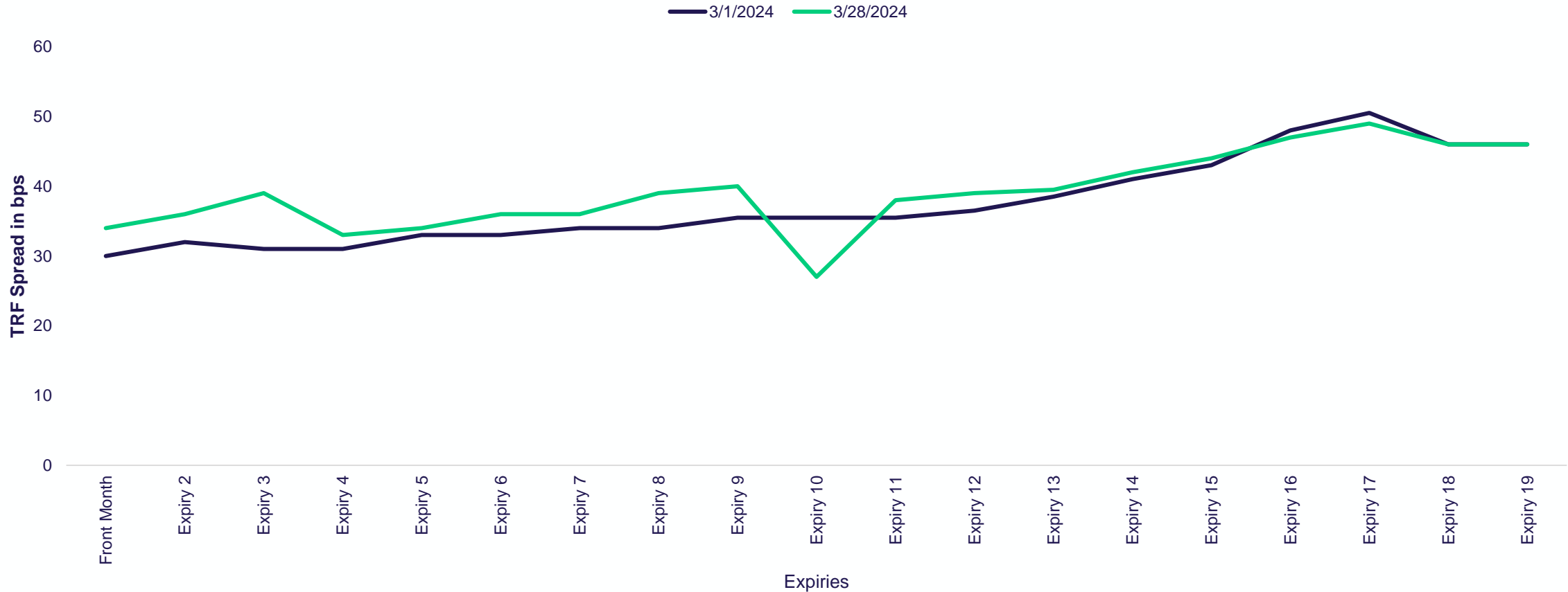
FTSE® 100 Index TRF (TTUK) Spread comparison

Relative steepness of the term structure provides trading opportunities