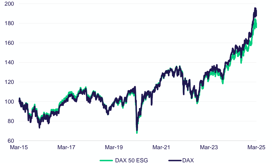
Performance (EUR TR): Mar 31, 2015 to Mar 31, 2025