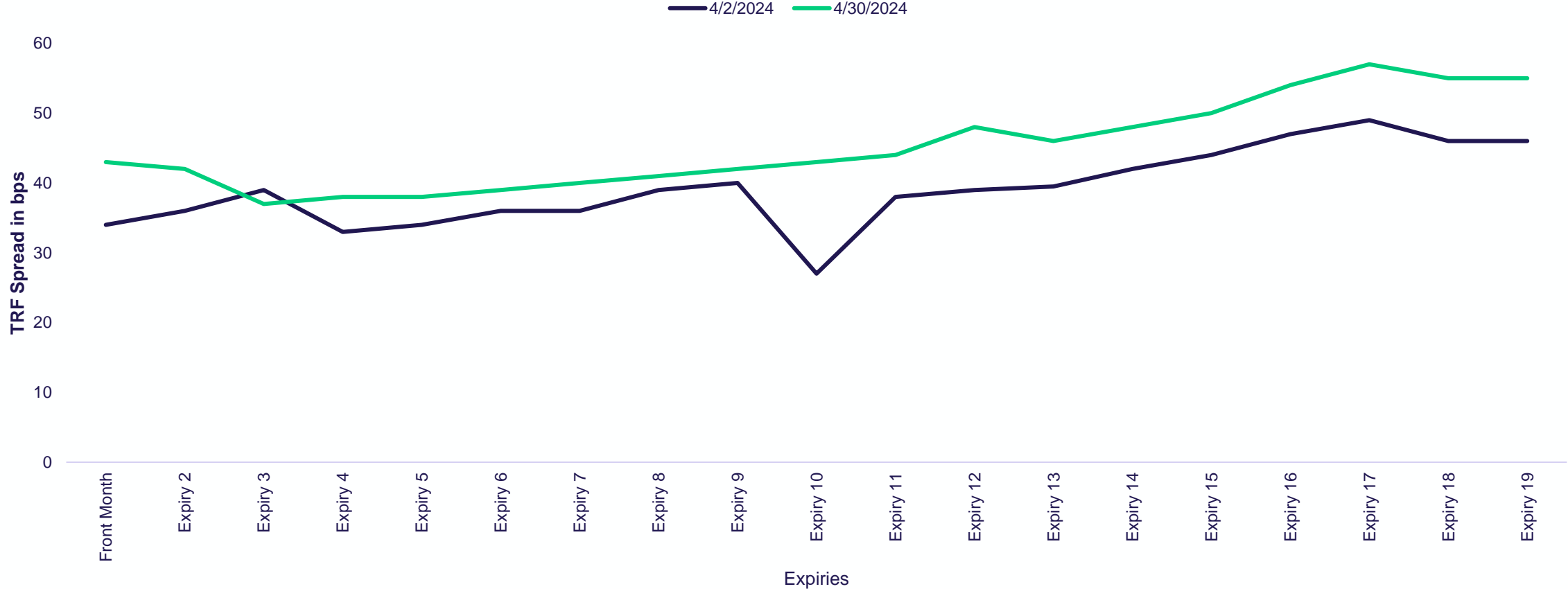
FTSE® 100 Index TRF (TTUK) Spread comparison

Relative steepness of the term structure provides trading opportunities